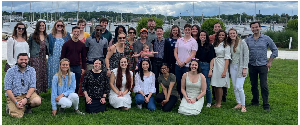
Brown Medical Psychiatry Residents

The BYC DEI (Diversity, Equity and Inclusion) and Membership committees sponsored an event for the Brown Psychiatry Residency Program on Sunday, June 18th. The residency is a 4-year program and of the 40 residents enrolled, 36 joined with their partners/spouses and children. Many of these individuals had no prior exposure to our beautiful Narragansett Bay and the pleasures of the Rhode Island coastline.