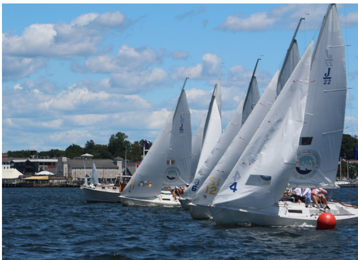
A close start in a race between teams from Roger Williams University and the Ida Lewis Yacht Club