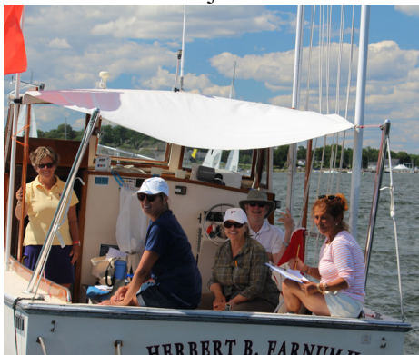
Many thanks to the race organizers, and umpires for making BYC's First Women's Drivers Race a huge success.

When BYC envisioned a fleet of keel boats to support activities at the Club, team racing was only one part of the puzzle. Today the J-22s are used for both junior and adult