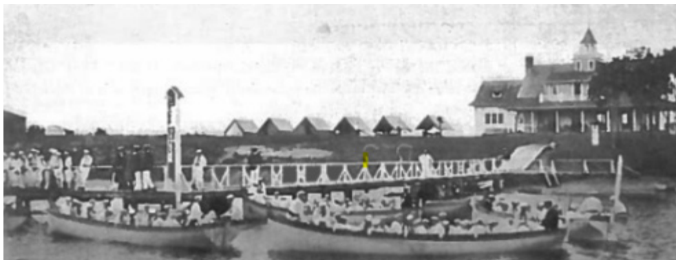
The original structure and dock of the BYC property on Prudence Island in the early 1900's

since 1977. We will tour the 3.5-acre grounds and update members on the Prudence Island Joint Committee's work and findings - including improvements to the stairs, strategy to get additional mooring permits, etc. The Committee will welcome questions and suggestions on how to better use our waterfront gem. If your boat is out of the water, we will be taking the Club's work boat. Timing and other details to follow.