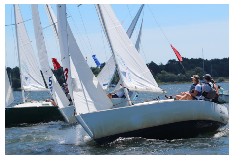
St. Mary's alumni approaching the first mark.

their associated racing programs, many recent college grads and racers who had not previously considered Bristol as home base for sailing are joining J-22 crews, participating in J-22-based races, and in some cases joining the Club. The benefits for the Club in terms of membership growth and diversity complement nicely the broader positive impact of BYC's