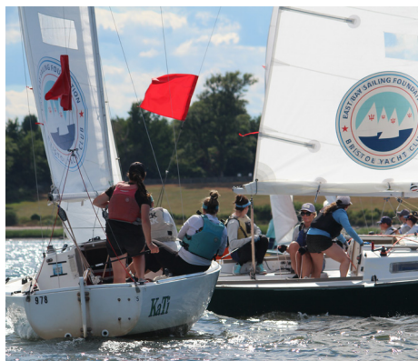
St. Mary's alumni executing a passback on Bristol

instructional sailing; one design, PHRF racing, and team racing; as well as day sailing by members.