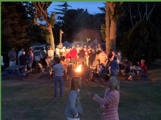
BYC's Wednesday night racers enjoyed the friendship and camaraderie of their fellow racers at the Steak and Swordfish dinner on Aug. 17.

Friends are like coals in a fire - Together they glow; apart, they grow cold.